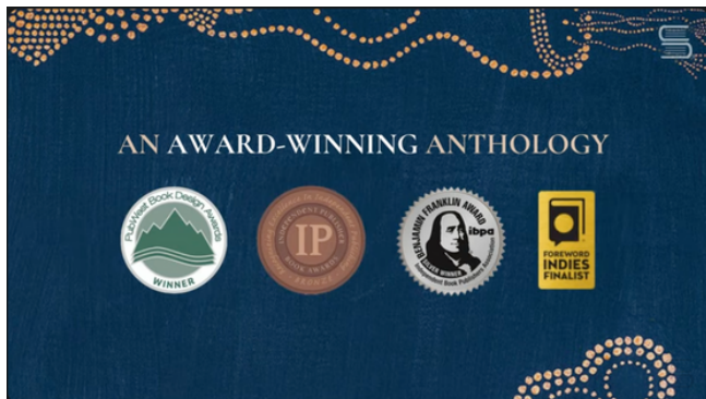
Book Trailer (one-year anniversary version)