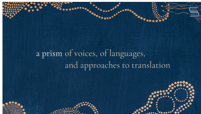
Book Trailer (short version)